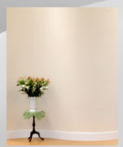
Skim coat and finish in 3. the usual manner.