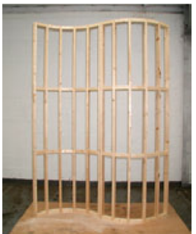
Construct your framework with the