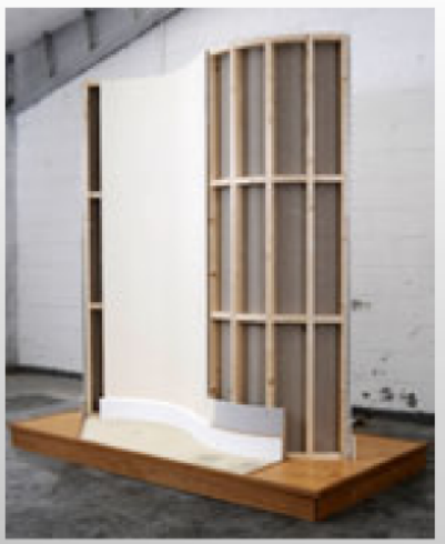
Attach the V-Cut curved plasterboard to the frame using standard