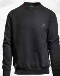
CREW NECK SWEATSHIRT