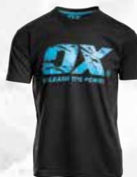
CREW NECK T-SHIRT