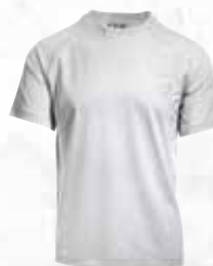
TECH CREW SHIRT