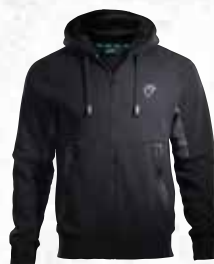
ZIP THROUGH HOODIE