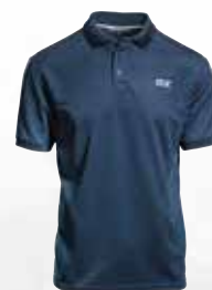
TECH POLO SHIRT