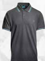
PIQUÉ POLO SHIRT